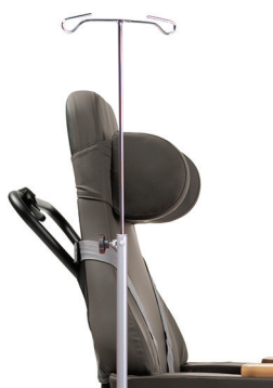
Option B52 Serum holder