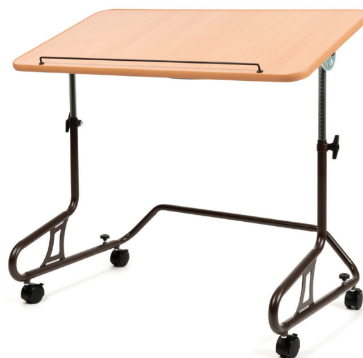
Option: 378 table