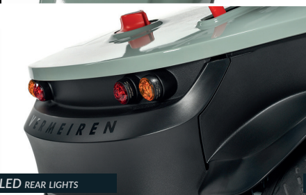
LED REAR LIGHTS