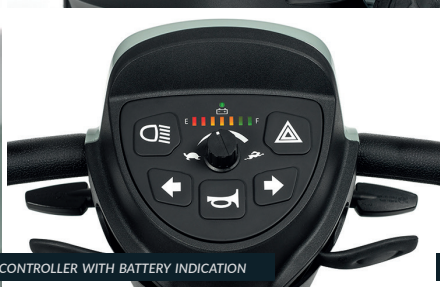
CONTROLLER WITH BATTERY INDICATION