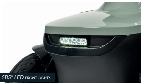
SBS* LED FRONT LIGHTS