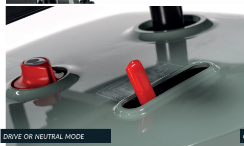
DRIVE OR NEUTRAL MODE