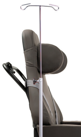
Option B52 Serum holder