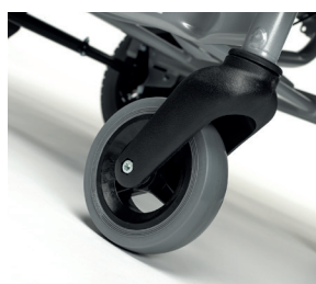
Extra-large, sturdy front wheels